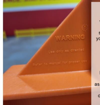
The 2-N-1 system is designed to assist workers on aerial lifts. Always follow safety specifications of the lift you're using. With proper use, you will prolong the life of the tool and benefit from the ease it provides for your tough trade. It will save companies time and money, as well as personal fatigue & strain from working off the floor of your lifts.